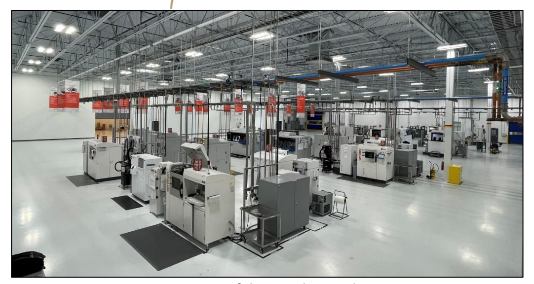
Figure 1: Image of the AM Floor and Printers

The primary objective of this program is to design a system and series of sensors to track components through printing, heat treatment, part removal, part finishing, machining, inspection, and shipping. The system needs to be able to indicate physical location within one of these process areas and display that information in an easy to understand digital representation (ex: model of the facility, 2D floorplan, etc). This data should also be able to be exported into a report format which can be used as a reference for program managers and engineers. Possible solutions to this challenge may include the use of RFID sensors and/or GPS tracking devices but these should not be considered firm requirements or limitations. It is up to the team to think broadly about possible solutions and determine how to best solve this challenge.