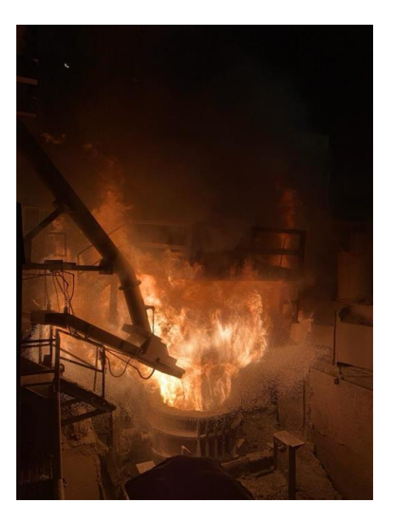
Furnace tapping into ladle with alloys being added through the chute.