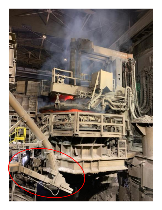
Alloy chute where operators add and push material into the ladle.

During our manufacturing process, scrap metal is melted down and impurities removed. Chemical testing then is done to determine the composition of the batch. Additives such as manganese, silicon and carbon are input into the batch to reach the desired composition for the batch. Carbon is added in large quantities, typically by adding 2-4, fifty pound bags into the molten steel filled ladles. Currently, this is done manually by hand on an alloy chute. The operators lift the 50 lb. bags into the chute entrance and push them down the slide which sends the bag into the ladle. When this happens, a reaction occurs which produces fire. The picture on the lower left shows the chute and the picture on the lower right shows the reaction after the bag enters the ladle.